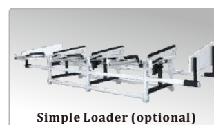
Simple Loader (optional)