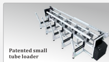
Patented small tube loader